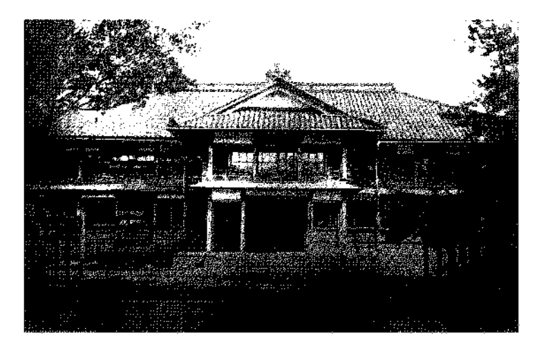
Figure 6 The Toyama Ken Kogei Gakko (renamed Toyama Kenritsu Kogei Gakko in October 1901), Takaoka, in the 1890s.