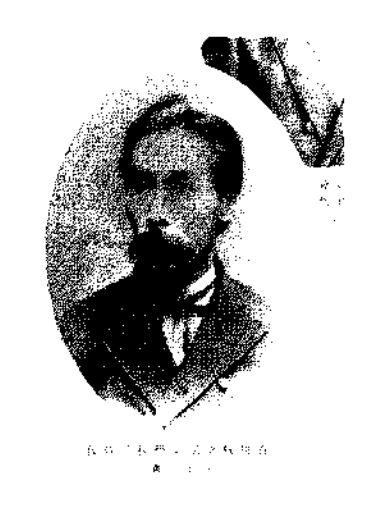
Figure 5 Notomi Kaijiro, director of the Ishikawa Kan Kogyo Gakko , around 1890.

Crafts. To judge from its curriculum (figure 9), the Drawing Department was a kind of design department. The Art Crafts Department concentrated on crafts. The Common Crafts Department was a department of industry and technology, rather than that of crafts. However, what they called Common Crafts was neither mechanical engineering nor chemical engineering. The Common Crafts Department consisted of divisions of dyeing, copper casting, marine products, sewing, lacquering, and pottery making. Therefore, compared with the Art Crafts Department, which consisted of divisions of wax sculpture, drawing for dyeing, pottery painting, wood-stone-ivory sculpture, and embroidery, the Common Crafts department dealt with crafts for the common man. "Futsu" of "Futsu-kogei-bu," the Japanese name of the Common Crafts Department, means "common," "ordinary," "average," or "everyday." For example, both lacquered and marine products were not only a Japanese specialty, but also what Japanese people, average as well as above average, used and consumed every day. The word and concept of "futsu" was important in the history of design education in modern Japan.