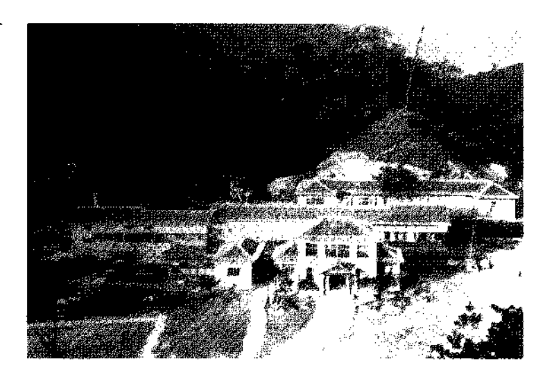
Figure 11 The Saga Kenritsu Saga Kogyo Gakko Arita Bunko (former Saga Ken Kogyo Gakko Arita Bunko before June 1901, renamed Saga Kenritsu Arita Kogyo Gakko in April 1903), May 1902.