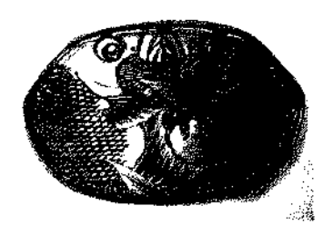
Figure 7 Carved and lacquered tray, Tai-bon (Mukai-dai ), designed by Notomi in 1894–97. (Courtesy of the Toyama Kenritsu Takaoka Kogei Koto Gakko and K. Joho, Takaoka).