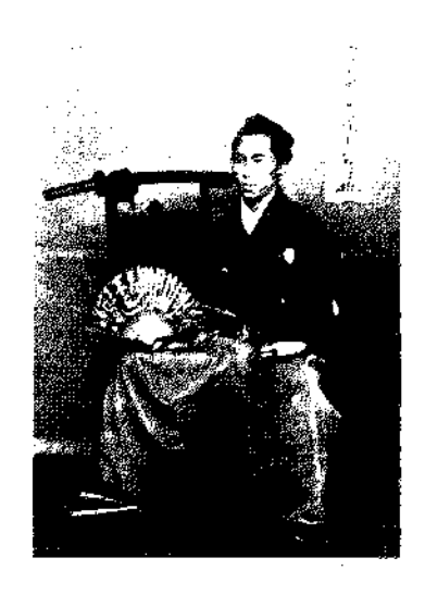
Figure I Notomi Kaijiro, immediately before the 1862 Envoy to Shanghai (from Notomi Sensei Dozo Kensetsu in ed., Notomi Sensei Dozo Kensetsu Kinen-cho, 1934).